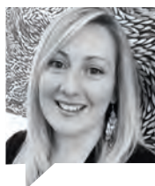
KERRY-ANNE BLANKET KAB Gallery, Terrigal

ART EDIT'S PANEL OF EXHIBITION EXPERTS TAKE A CLOSER LOOK AT THESE FOUR ARTWORKS.